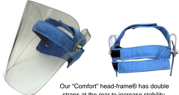
Our "Comfort" head-frame® has double straps at the rear to increase stability.